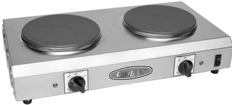
Model CDR-2CEN Double Burner Cast Iron Hot Plate Two 7-1/2" diameter cast iron elements 120 Volts/900 Watts per burner; 1,800 Watts total