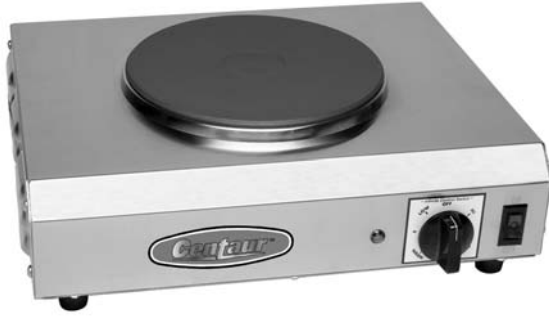
Model CSR-2CEN Single Burner Cast Iron Hot Plate 7-1/2" diameter cast iron element 120 Volts/1,500 Watts