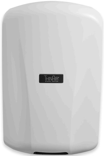
TA-ABS White Polymer (ABS) With SanaFor™ Antimicrobial Additive