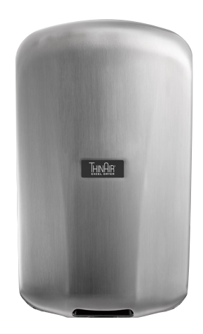
TA-SB Brushed Stainless Steel