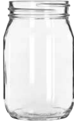
Drinking Jar No. 92103 16 oz./47.3 cl./473 ml. H \frac{5}{4} T \frac{2}{8} B \frac{2}{8} D \frac{3}{8} 1 doz./6# • .41 cu. ft. SCC 472540