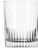
Rocks No. 15626 + 8 \frac{1}{2} oz./25.1 cl./251 ml. H \frac{3}{8} T3 B \frac{2}{8} D3 3 doz./23# • .87 cu. ft. SCC 005168