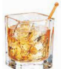
Rocks No. 5279 9 oz./26.6 cl./266 ml. H \frac{3}{2} T3 B \frac{2}{4} D3 3 doz./34# • .91 cu. ft. SCC 766468