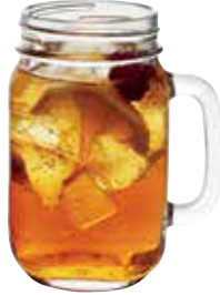
Drinking Jar No. 97084 16 \frac{1}{2} oz./48.8 cl./488 ml. H \frac{5}{4} T \frac{2}{8} B \frac{2}{8} D \frac{4}{8} 1 doz./12# • .63 cu.ft. SCC 871421