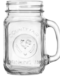
Drinking Jar No. 97085 16 \frac{1}{2} oz./48.8 cl./488 ml. H \frac{5}{4} T \frac{2}{8} B \frac{2}{8} D \frac{4}{8} 1 doz./12# • .62 cu. ft. SCC 866288