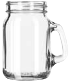
Drinking Jar No. 97124 4.75 oz./14.0 cl./140 ml. H \frac{3}{8} T \frac{1}{8} B \frac{2}{8} D \frac{2}{8} 1 doz./5# • .21 cu.ft. SCC 495259