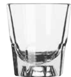
Old Fashioned No. 5131 4 oz./11.8 cl./118 ml. H \frac{3}{8} T \frac{2}{8} B \frac{2}{4} D \frac{2}{8} 4 doz./33# • .99 cu. ft. SCC 370129