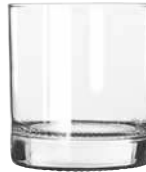
Rocks No. 9171CD ▲ ● 11 oz./32.5 cl./325 ml. H \frac{3}{2} T \frac{3}{4} B \frac{3}{8} D \frac{3}{4} 3 doz./26# • 1.05 cu. ft. SCC 087051