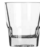
Old Fashioned No. 5130 5 oz./14.8 cl./148 ml. H \frac{3}{8} T \frac{2}{8} B \frac{2}{4} D \frac{2}{8} 3 doz./19# • .74 cu. ft. SCC 073221