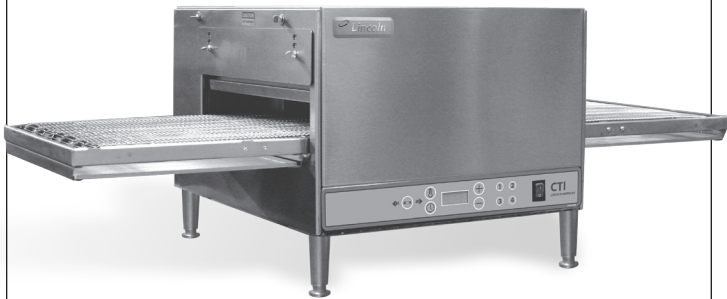
Shown with 50" (1270 mm) extended conveyor.