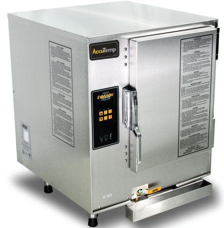
with optional bullet feet

Evolution™ steamer is AccuTemp Products' connected, boilerless steam cooker that utilizes AccuTemp's Patent Pending Steam Vector Technology for faster cook times, improved energy efficiency, better pan to pan uniformity, and less water consumption. Steam Vector Technology requires no moving parts inside the cooking chamber. Steam to be produced inside the cooking cavity with no heating element exposed to water. Easily connects to water and drain line. Uses less than 1.5 gallons of water per hour. Unit to include low water, high water, overtemp warning lights and auto shut off feature. Evolution™ to include heavy duty, field reversible door. Standard digital controls with independent timer. No water quality exclusions to warranty and no water filtration or treatment required. Unit to be UL Safety and Sanitation Certified, and Energy Star qualified. Built in USA.