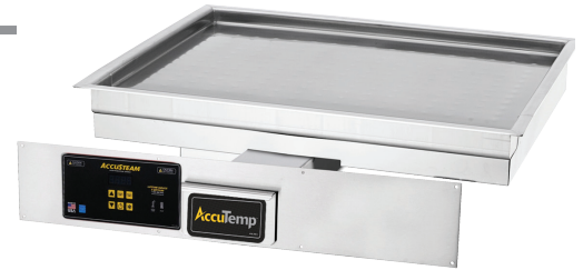
EGD-B36 AccuSteam™ Drop-In Griddle