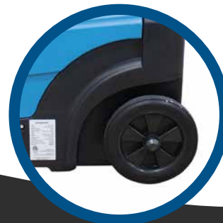
Wheels for Easy Transport