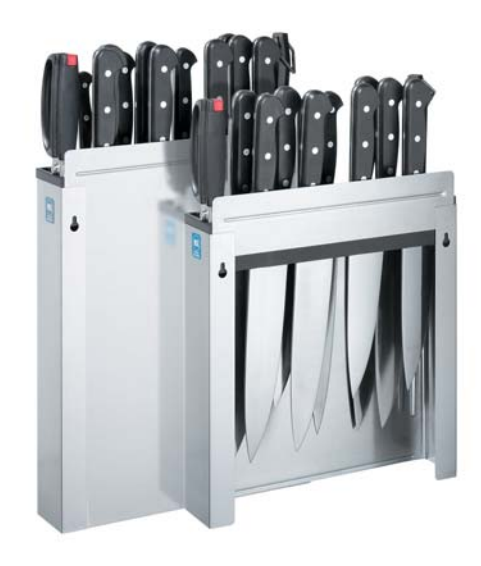
Back view of the KR-699 and KR-700 shows differentiation of the KR-700's stainless steel back for increased sanitation.