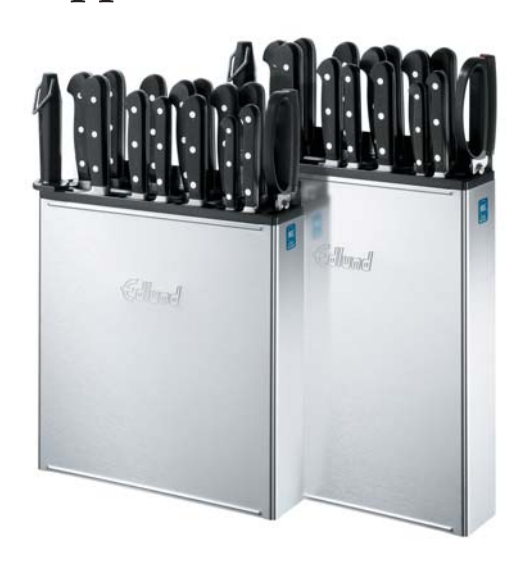
Front view of the KR-699 and KR-700 (14"/35.6 cm longer skirt) with a stainless steel skirt that protects knives and operators from accidents.