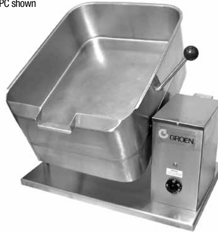
Model TD/FPC shown

Unit to be thermostatically controlled to automatically shut off when desired temperature is reached and to turn on when product temperature falls below desired setting. Unit to have Hi Limit thermostat as safety feature.