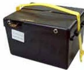
12 Volt Sealed Lead Acid [SLA] High Rate Series