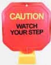
Octagon Warning Sign