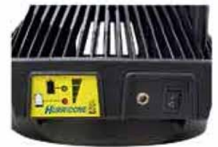
LED & Audible Warnings of Low Battery Voltage