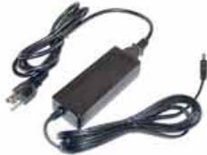
Smart Charger Circuitry: Eliminates the need to unplug the unit after charging