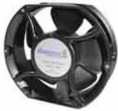
50,000 hour long life brushless DC motor