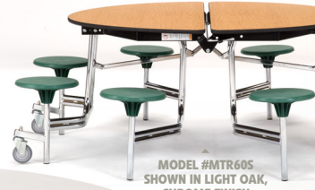
MODEL #MTR605 SHOWN IN LIGHT OAK, CHROME FINISH