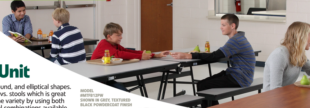
MODEL #MTFB12PW SHOWN IN GREY, TEXTURED BLACK POWDERCOAT FINISH