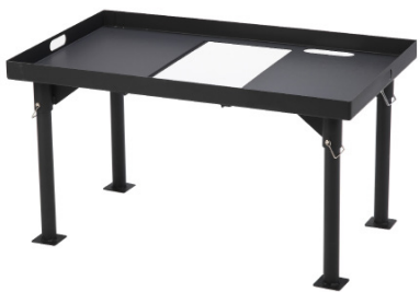
TB-36 Table Stand