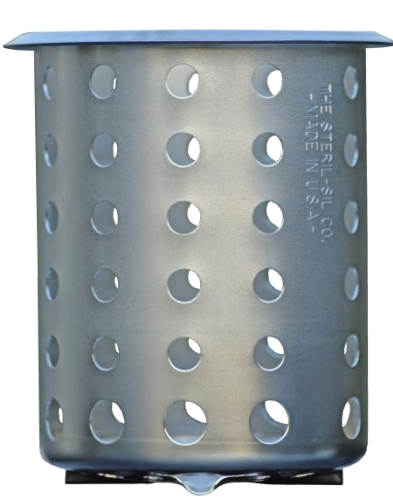
Model #: S-500 Lifetime Warranty