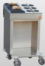
E1-CRT24-2V 24" E1 System Open Cart with Accessories