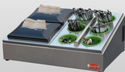
E1-CBD-2V E1 Countertop Dispenser with Accessories