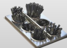
E1-DDF-1VH E1 System Drop-In Flush Mount Dispenser

See the E1 Dispenser pages for additional options and details