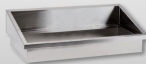
E1-DDA-3V E1 System Drop-In Angled Dispenser