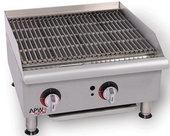
Model GCRB-24i Gas CharRock CharBroiler