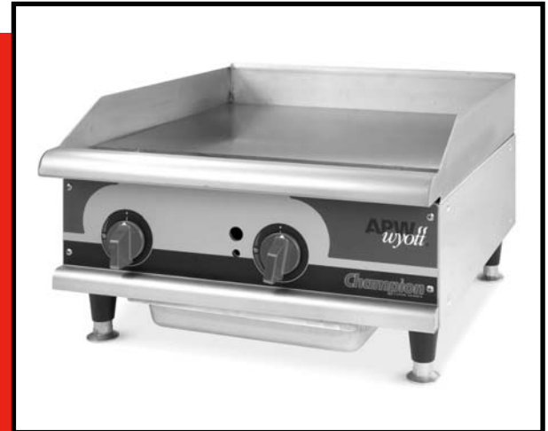
Model GGM-24H Gas Manual Griddle