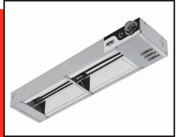
FD SERIES OVERHEAD WARMERS