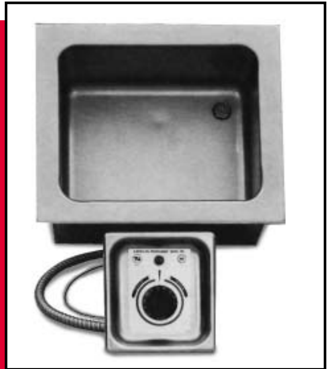
Top Mount Hot Food Well