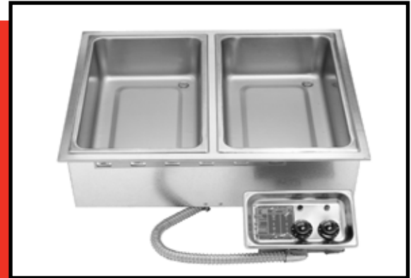
Top Mount w/EZ-Lock