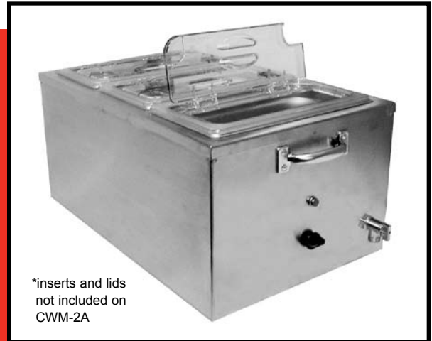
*inserts and lids not included on CWM-2A