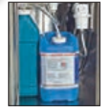
Interior compartment stores fresh and waste water containers, pump and water heater.