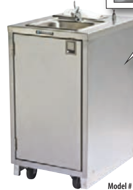
Model # 9620 Shown with optional caster skirting and top-mount towel dispenser