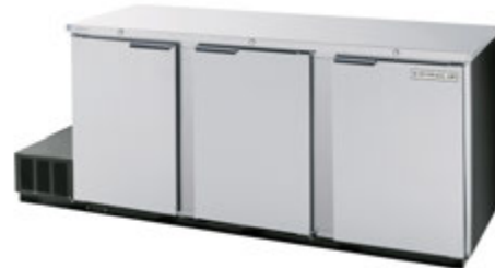
BB78 END MOUNT