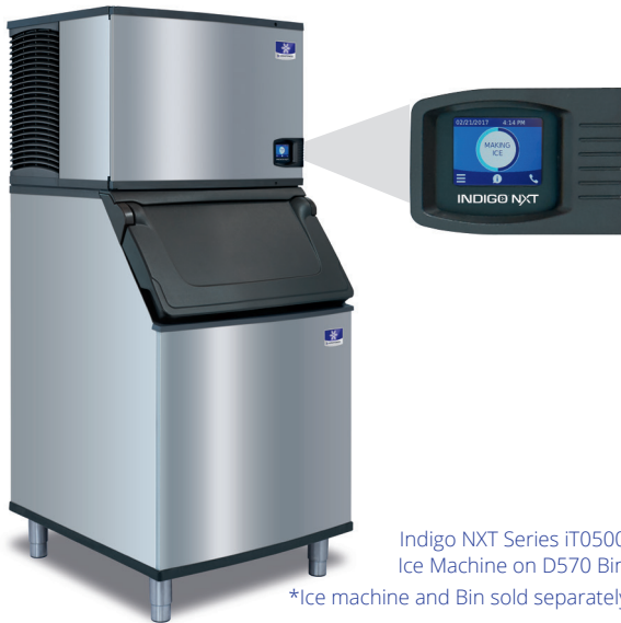
Indigo NXT Series iT0500 Ice Machine on D570 Bin *Ice machine and Bin sold separately

Designed for operators who know that ice is critical to their business, the Indigo NXT Series ice machine's preventative diagnostics continually monitor itself for reliable ice production. Improvements in cleanability and programmability make your ice machine easy to own and less expensive to operate.