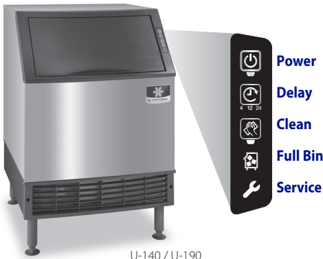
U-140 / U-190