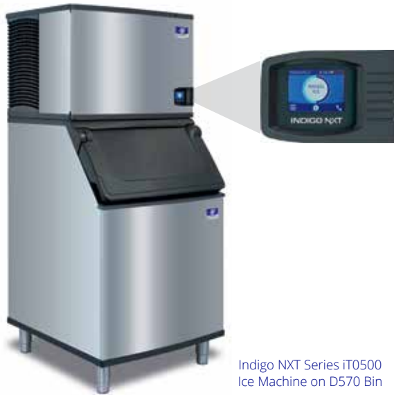
Indigo NXT Series iT0500 Ice Machine on D570 Bin

Designed for operators who know that ice is critical to their business, the Indigo NXT Series ice machine's preventative diagnostics continually monitor itself for reliable ice production. Improvements in cleanability and programmability make your ice machine easy to own and less expensive to operate.