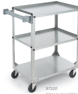
97320 (shown assembled)