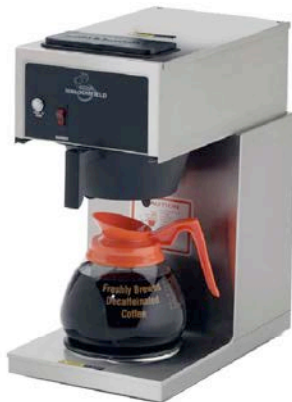
8542-D1 with optional decanter

8543-D2 Koffee King® Two Warmer In-Line Pour-Over, Lo-Profile® Coffee Brewer