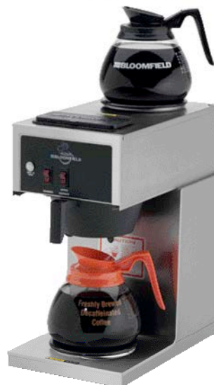
8543-D2 with optional decanter

If you're looking for rich, flavorful coffee but are tight on counter space, plug in the Bloomfield Lo-Profile® Pour-Over brewing system. At a little under 17" tall, it's short in stature, but long on features. Like all Bloomfield products, this proven, efficient brewing system is designed to take advantage of the finest electrical components and has the lowest service cost in the industry for this type of brewer. Our exclusive water delivery system spreads a precise amount of water over the coffee grounds for complete saturation and much better taste.