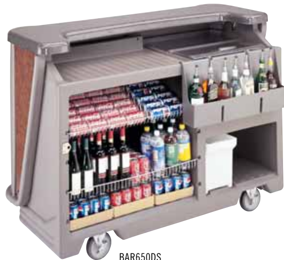
BAR650DS Shown with two optional wire racks; see details under Portable CamBar Packages & Accessories.