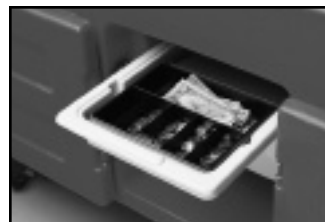
Open holding compartment holds cash drawer and box. (included)