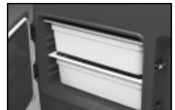
Two insulated holding compartments each hold up to 4 each GN 1/1 Full Size 6" (15 cm) deep Food Pans.