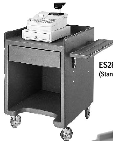
ES28R (Standard Tray Rail Height)