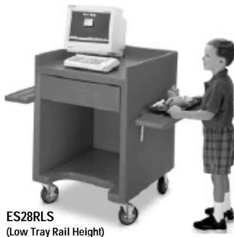
ES28RLS (Low Tray Rail Height)