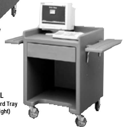
ES28RL (Standard Tray Rail Height)