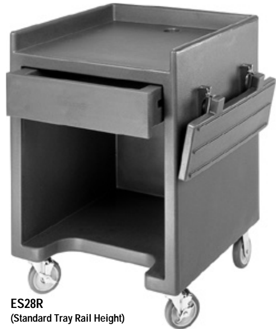
ES28R (Standard Tray Rail Height)