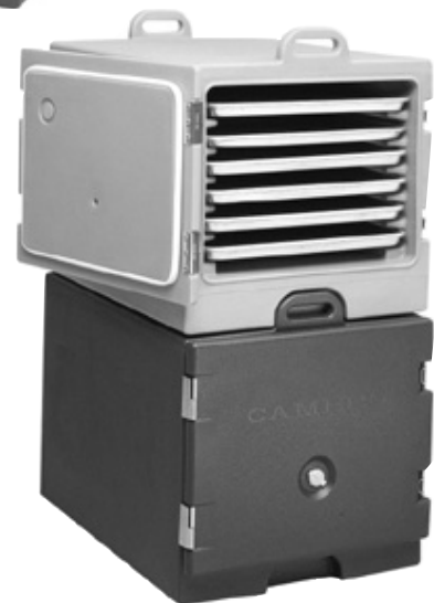
1826MTC (For Trays and Sheet Pans)