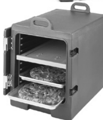
1318MTC (For GN Food Pans and Trays and Sheet Pans)