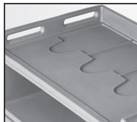
Recessed top on Model MDC24 holds 3 each, 1 gal. (3,8 L) Camtainers and stacked Condiment Bins.