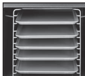
Organize Food Pans and Trays by placing the Optional Wire Rack inside the insulated compartments.