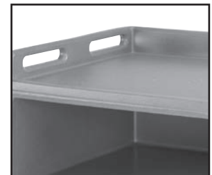
Model MDC24F has a flat top counter to allow menu service flexibility.