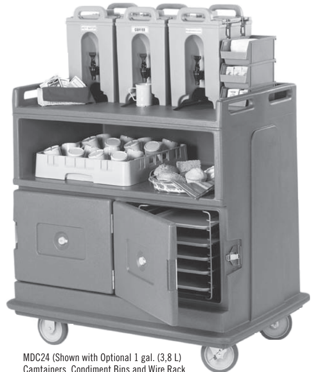
MDC24 (Shown with Optional 1 gal. (3,8 L) Camtainers, Condiment Bins and Wire Rack with Metric Camtrays)