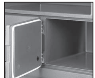
Closed compartments also hold supplies.