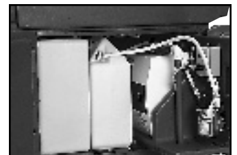
Tanks and Hot Water Heater