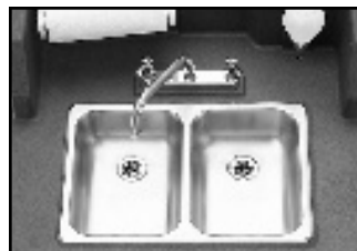
2-Compartment Stainless Steel Sink