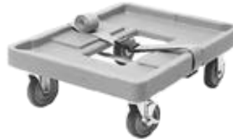
CD400 (Shown with Optional Strap)