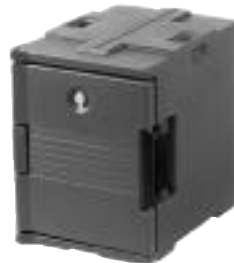
For Camcarrier (UPC400)