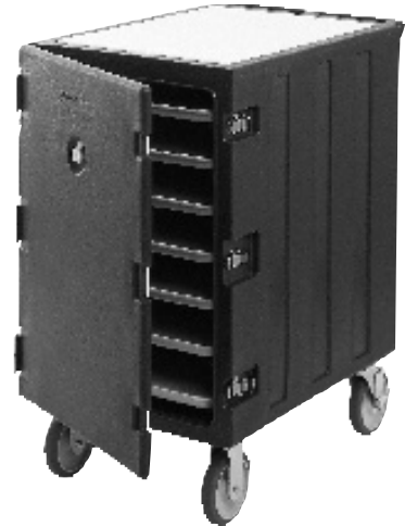
1826LTC3 (For Trays & Sheet Pans)