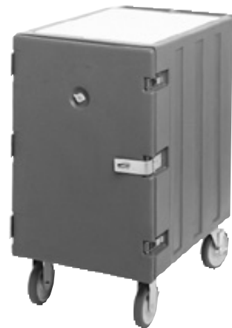
1826LBCSP (With Security Package)