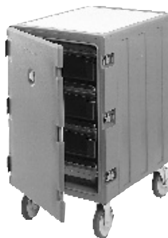
1826LBC (For Food Storage Boxes)