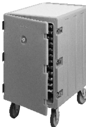
1826LTC (For Trays & Sheet Pans)