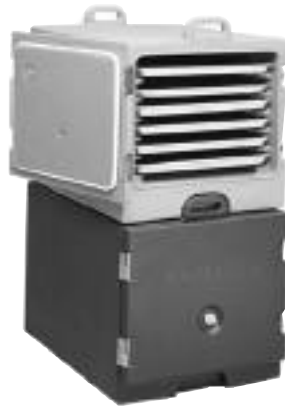
For Camcarrier 1826MTC (Camcarrier for Trays & Sheet Pans)