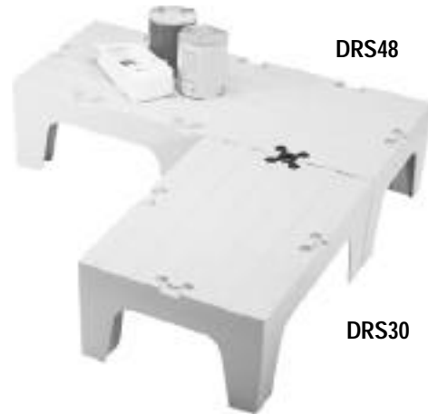
S-Series Solid Top Dunnage Racks