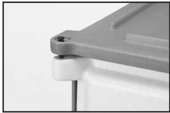
Durable nylon hinge pins & clips can be easily removed for cleaning.