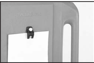
Menu clip keeps service instructions clearly visible.