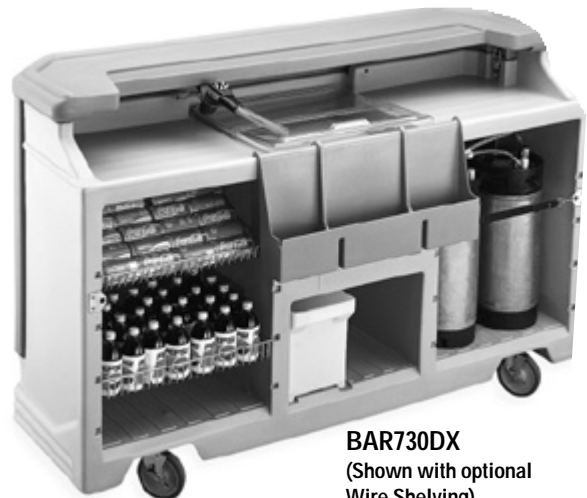
BAR730DX (Shown with optional Wire Shelving)