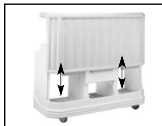
Detachable front for easy access to inventory and routing lines, tubes and hoses.