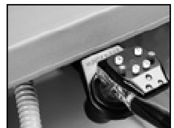
Premium quality 6-button, pre-mix soda gun by Wunder-Bar®.