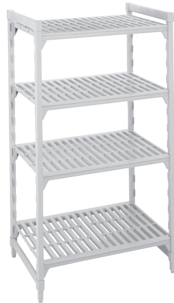
Four Shelf Unit with Vented Shelves.