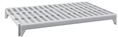
Vented Shelf Kit includes two Traverses and Vented Shelf Set for one shelf.