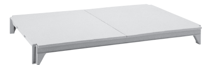
Solid Shelf Kit includes two Traverses and Solid Shelf Set for one shelf.