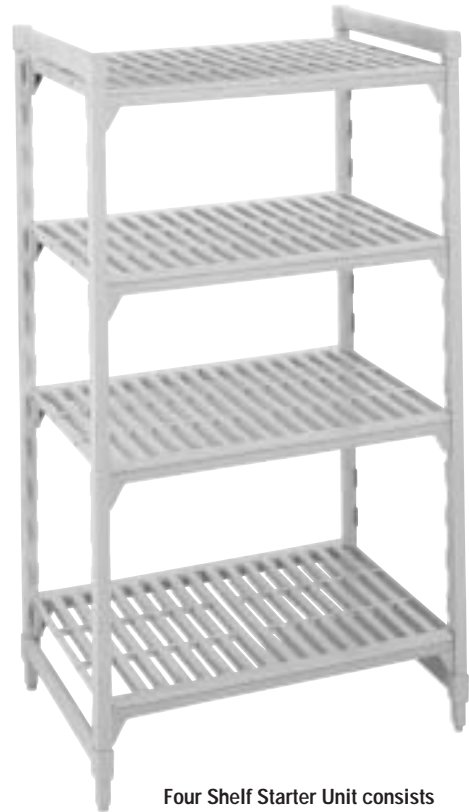
Four Shelf Starter Unit consists of two Post Kits and four Vented Shelf Kits.