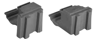
Set of Left and Right Corner Connectors (1 set required per shelf).