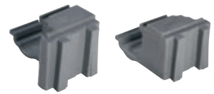
Set of Left and Right Corner Connectors (1 set required per shelf).