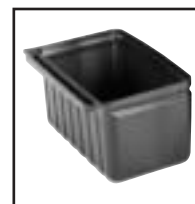
2.5 Gallon (9,5 L) Silverware Holder