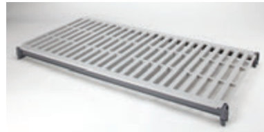
Vented Shelf Kit includes two Traverses and Vented Shelf Set for one shelf.