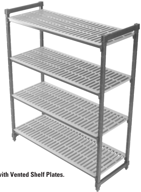
Four Shelf Unit with Vented Shelf Plates.