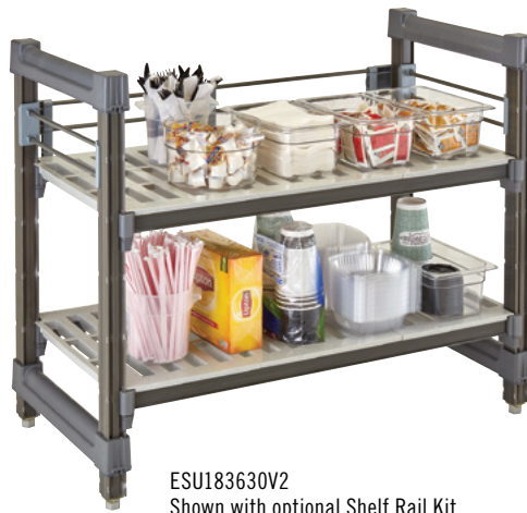
ESU183630V2 Shown with optional Shelf Rail Kit.