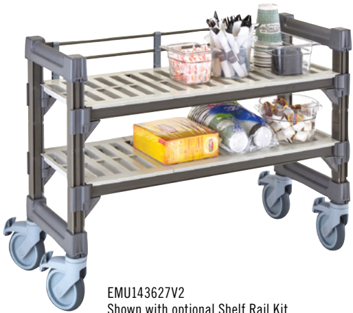
EMU143627V2 Shown with optional Shelf Rail Kit.