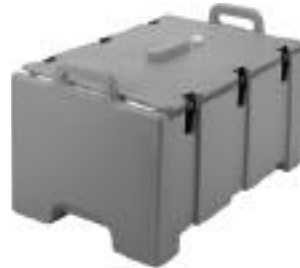
For Camcarrier (100MPC)