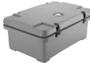
For Camcarrier (160MPC)