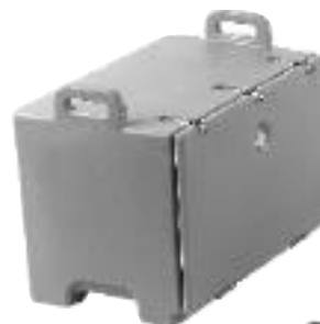
For Camcarrier (200MPC)