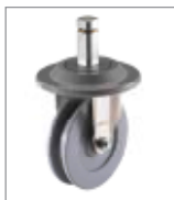
High Density Caster