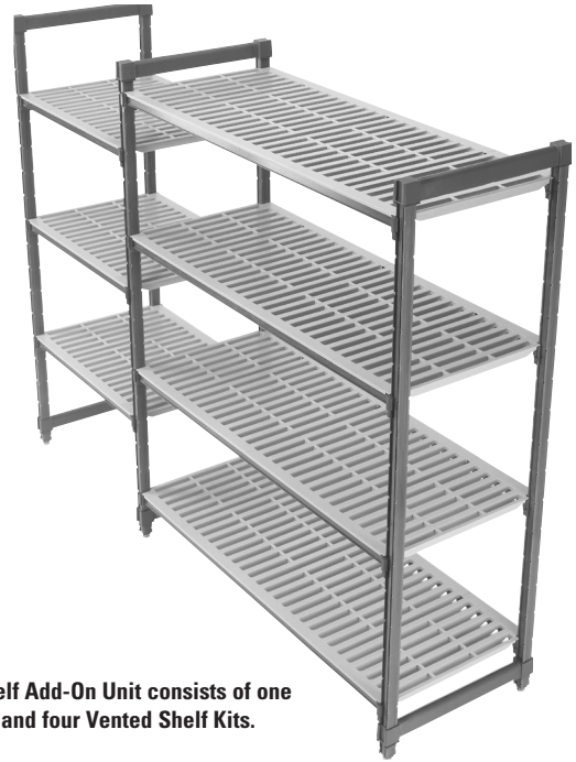
Four Shelf Add-On Unit consists of one Post Kit and four Vented Shelf Kits.