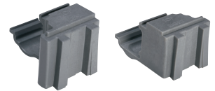
Set of Left and Right Corner Connectors (1 set required per shelf).